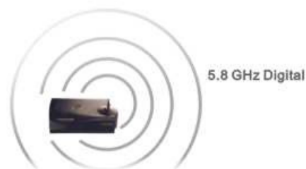
Amphony L1540 application

http://www.decibelhifi.com.au/category15_1.htm